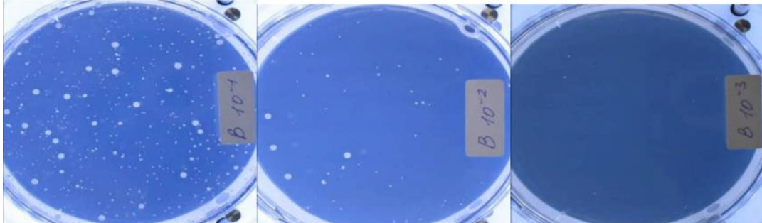
Bacterias reduced in the petri dishes during time